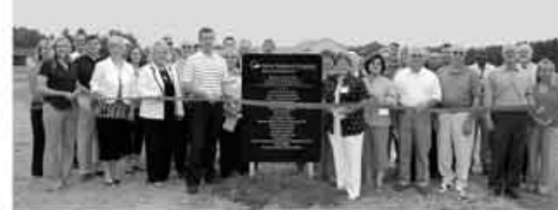
The new quarter-mile walking track at Taylor Regional Hospital