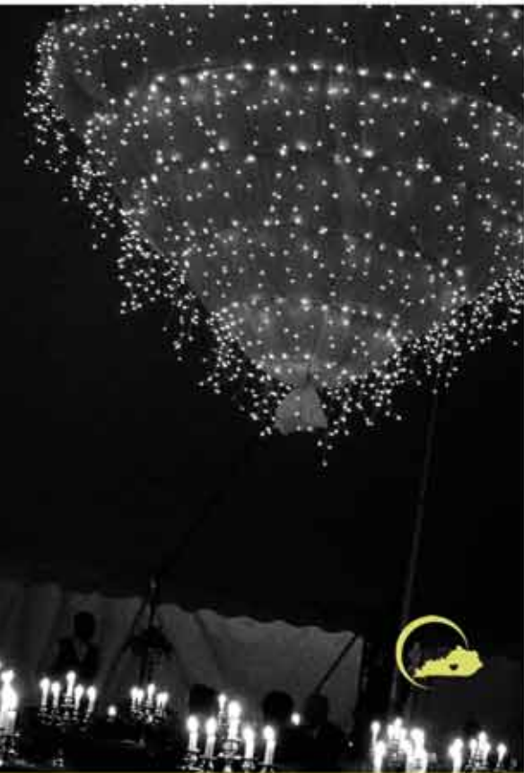
Lights twinkle as the 2008 H.O.P.E. Gala raises more than $40,000

Taylor Regional Hospital's services extend beyond individual patient care. We also offer a variety of educational programs, projects and amenities to provide comprehensive health care to the community we serve.