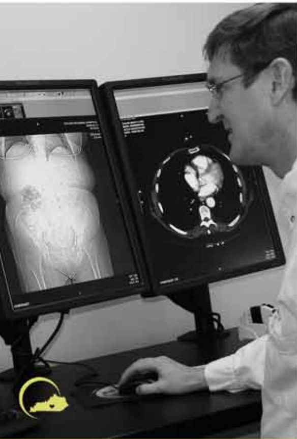
Taylor Regional Hospital has installed a Picture Archiving and Communication System (PACS)