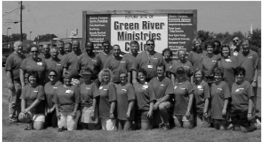
Management staff participating in the community service projects posed for a group photo.

The TRH management staff have been conducting leadership institutes as a part of their overall quality improvement process since 2002. This program focuses on six areas of achievement which include people, service, finance, quality, growth and community. 🍀