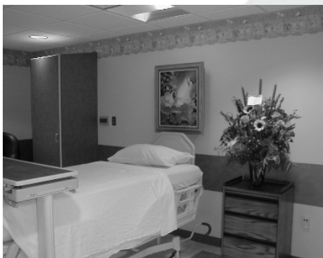
Above and top right are views of a patient room and hallway in the new wing.

Taylor Regional Hospital held a dedication ceremony for the new pediatric wing on October 10, 2006. Work has been completed on the $1.5 million renovated wing and includes nine private rooms for the youngest of patients at TRH. These rooms all have private baths and the latest in modern technology and convenience to ensure that their stay is as comfortable as possible.